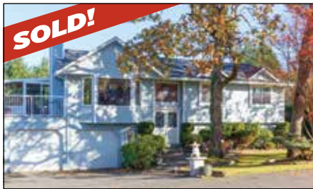
STRAWBERRY VALE $799,000