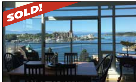
SONGHEES CONDO $829,000