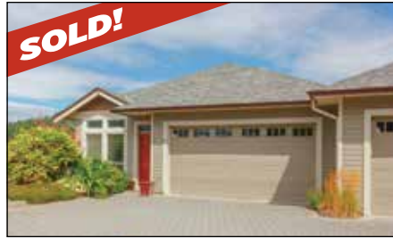
COLWOOD TOWNHOME $650,000