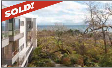
FAIRFIELD CONDO $350,000