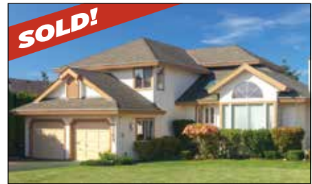
GORDON HEAD $899,000